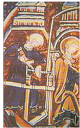
Woman using 13th century pole lathe