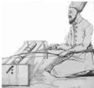
Indian bow lathe