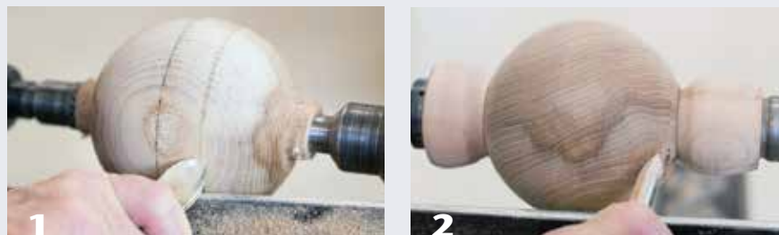
Direction of cut depends on grain orientation. At left, shear-cutting "downhill," from large diameter to small, on a sphere with the grain parallel to lathe bed. At right, shear-scraping "uphill," from small diameter to large, with sphere repositioned and its grain perpendicular to the lathe bed.