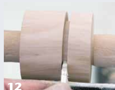
12 Parting tool cut showing some clearance on the left side of the tool after widening the cut.