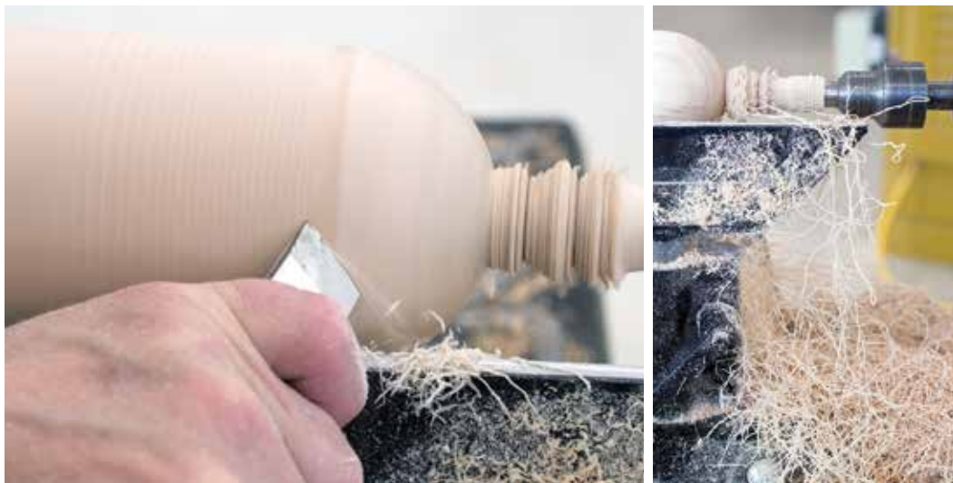
The fine "angel hair" shavings from a skew's shearing cut indicate a clean cut along the wood's sidegrain.

Sharp tools give clean cuts; dull tools do not. None of the other principles matter much if your tool isn't sharp, so check your tool sharpness first.