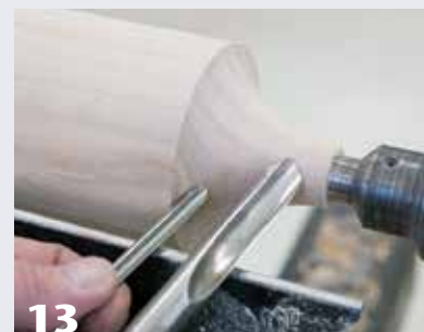
13 With relatively little mass, a ¼" (6mm) spindle gouge (at left) requires support from the toolrest close to the cutting tip. The heavier ½" (13mm) gouge is more stable and can be extended farther beyond the toolrest. Greater tool stability equates to a smoother cut.