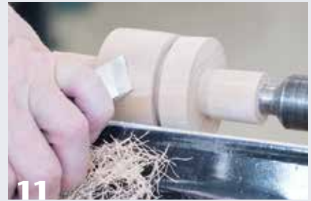
Three skew cuts, from left: scraping, peeling, and shearing. Each has its own angle of tool presentation and resulting pathway of shavings. The smoothest surface will result from the shearing cut, but each has its purpose.

2. Shavings must have a clear exit path. Examples of how common tools are designed to facilitate the removal of shavings include gullets in front of saw teeth, flutes in drill bits, and the window in a hollow-chisel mortising bit.